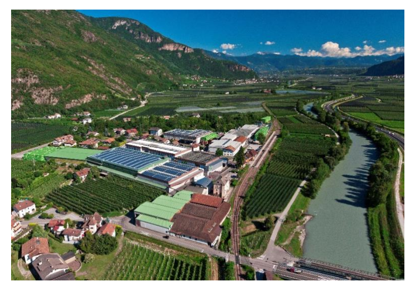
Picture 2, area of Fructus Meran and EGMA fruit auction in the middle of the South Tirolean apple growing area

After some bureaucratic obstacles could be solved, the production plant was moved to the current location on the Winkler site in 1986. Today it is one of the most modern apple and pear peeling companies in Europe. In the following years the fresh fruit business was greatly expanded and the quantities in processing rose rapidly. Peter Theiner, son of Fritz Theiner, after hin entry In Fructus, successfully build up the production of frozen apples and pears in 1992.